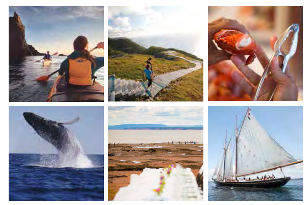
EXCELLerator Program | 2017/18