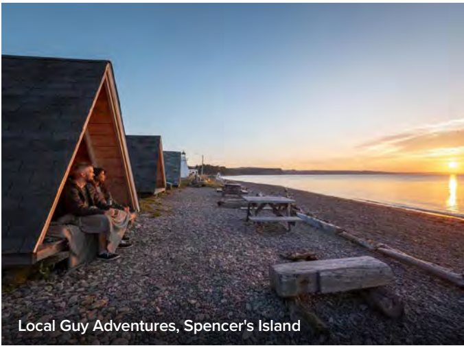
Local Guy Adventures, Spencer's Island