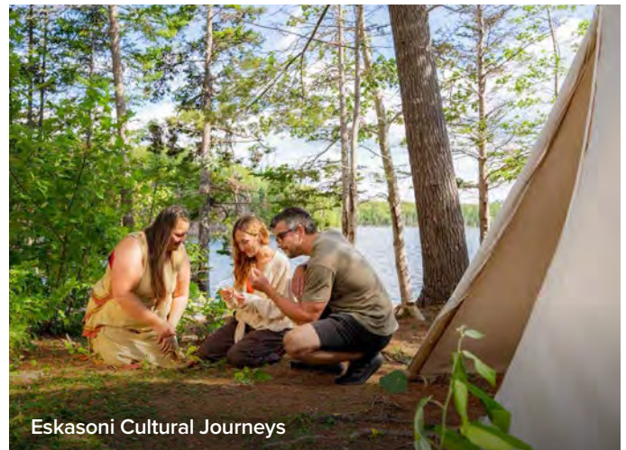
Eskasoni Cultural Journeys