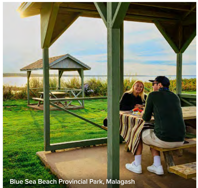
Blue Sea Beach Provincial Park, Malagash

To garner these insights, TNS is asking industry partners to complete the CTC Marketing Intake Form . This form will be available on the tourismns.ca website until March 31, 2025 . TNS will evaluate submissions and will use this input to inform the CTC marketing activities. A summary of the content selected for each activity will be available on the tourismns.ca website. A notification will be sent to all participants who complete the CTC Marketing Intake Form once the content information has been posted to tourismns.ca .