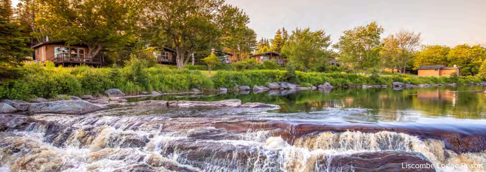
Liscombe Lodge Resort