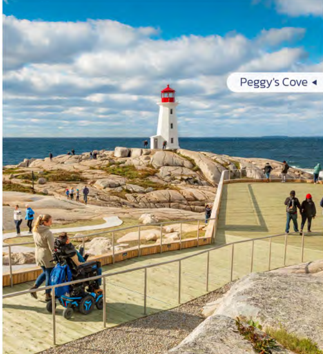
Peggy's Cove ◀